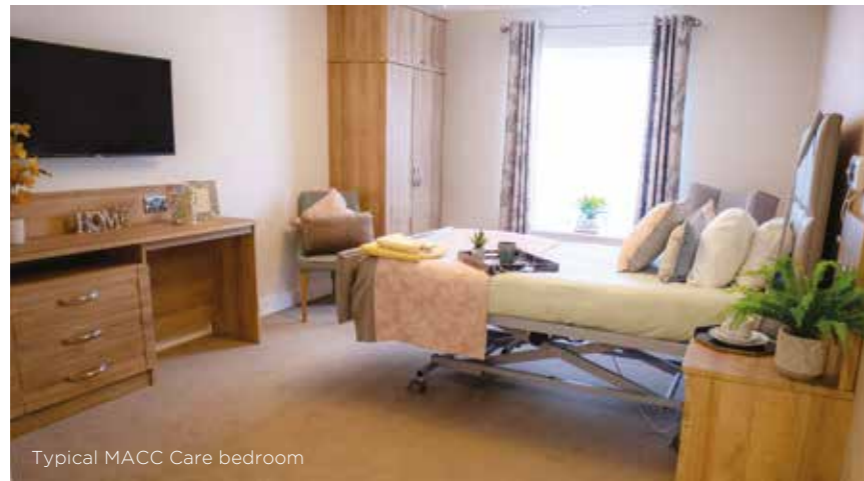
Typical MACC Care bedroom

Church Rose is a cheerful, purpose-built home located within the Handsworth area, providing quality care for up to 48 residents.